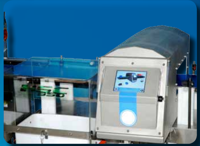
Multifrequency with touchscreen

The HSC350 statistic data acquiring system, which records the non-conformities detected by the Metal detector, can be either integrated in the machine, with a local printer and USB flash drive, or supplied in the STAT350 remote version.