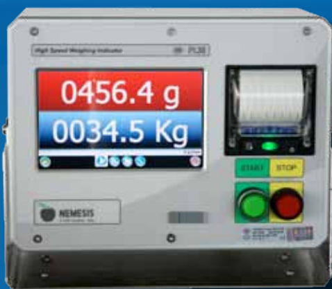
Intuitive and simple interface