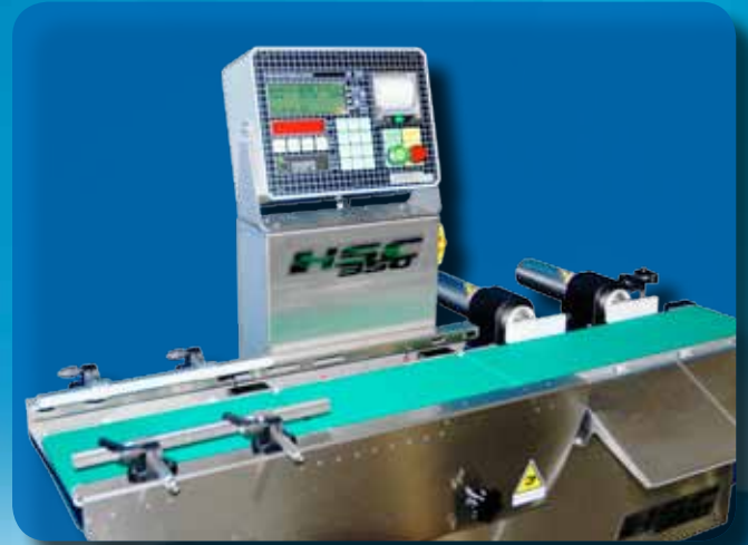
Up to 8 rejectors on-line