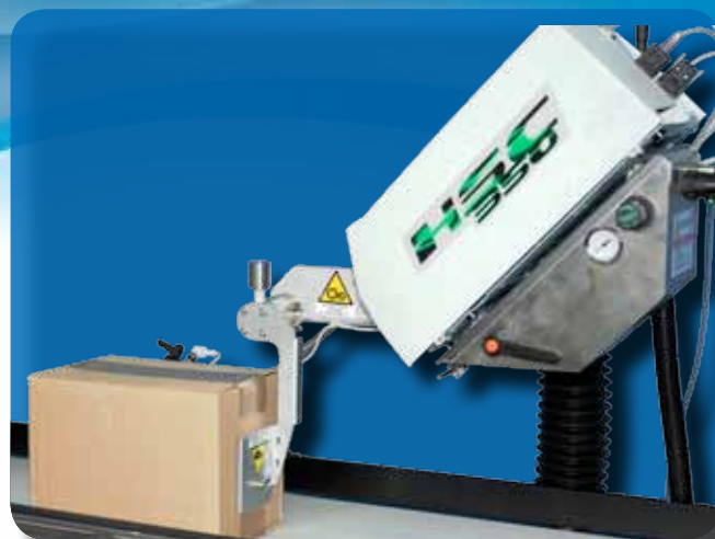
Front label application