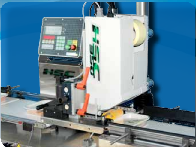
Labeling machine "C" type