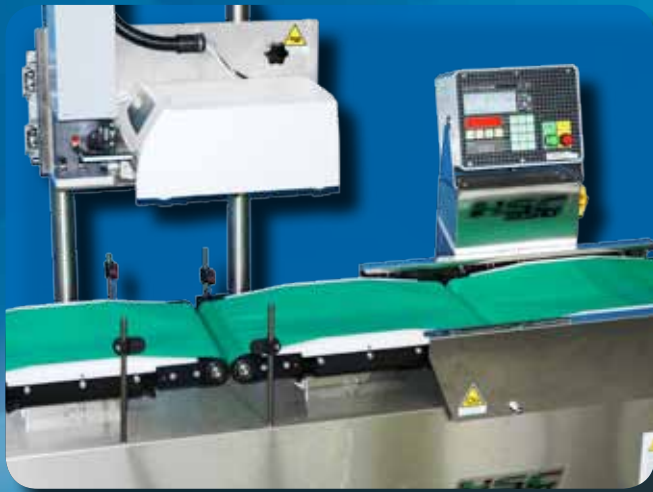
Top label application with special conveyor for round product