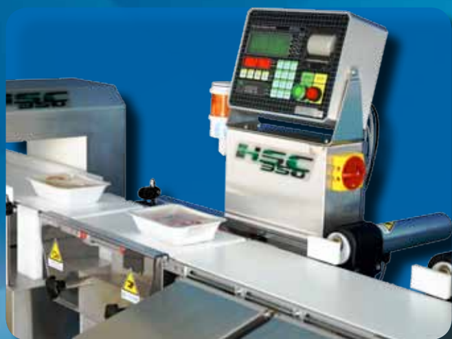
Combined with separated rejectors