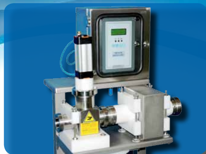
Special solution for minced meat