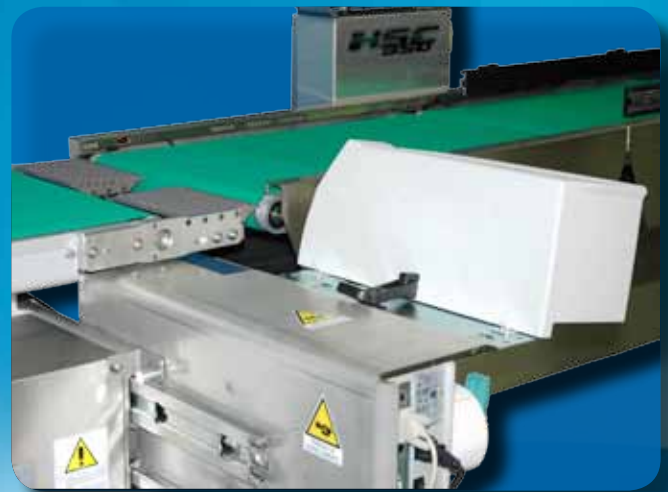
Bottom label application