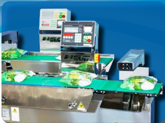
Rejector for delicate product