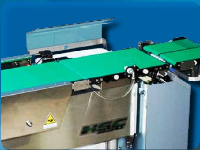
Bottom label application