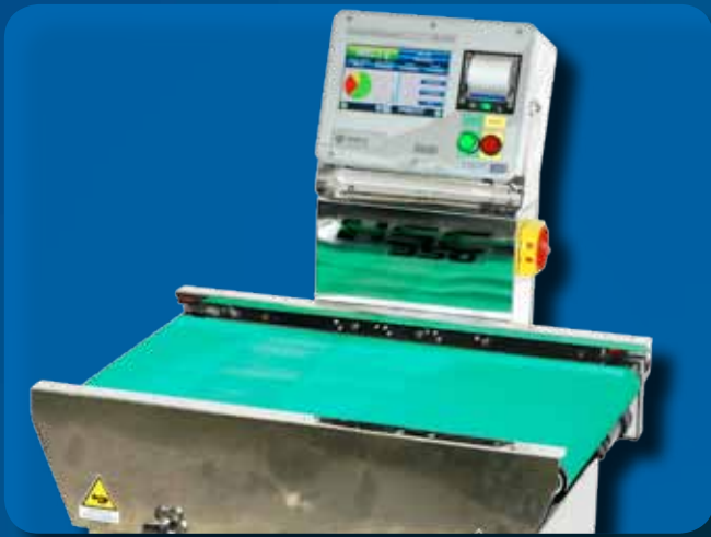
Serie H - single conveyor

The need to weigh and sort large, heavy products is becoming increasingly more frequent in modern logistics spheres.