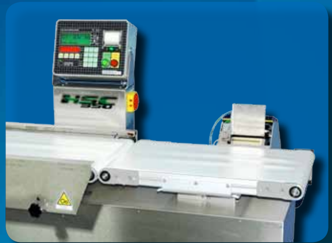
Side label application

Boxes, crates and other large packages can be weighed and labelled with fixed and variable weights thanks to "KH" series weighing-price marking machines.