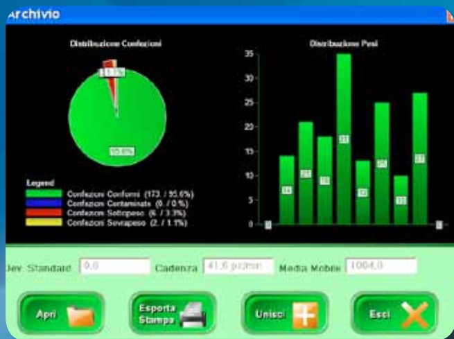
Batch statistics report