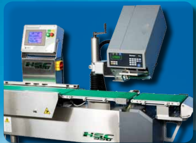
Two heads labeling machine