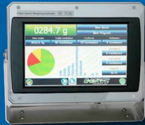
10" Touchscreen interface

Special attention to simple use plus unparalleled flexibility provide a comprehensive answer to the growing demands of users in the pharmaceutical sphere and other industries, where speed and accuracy are a must.