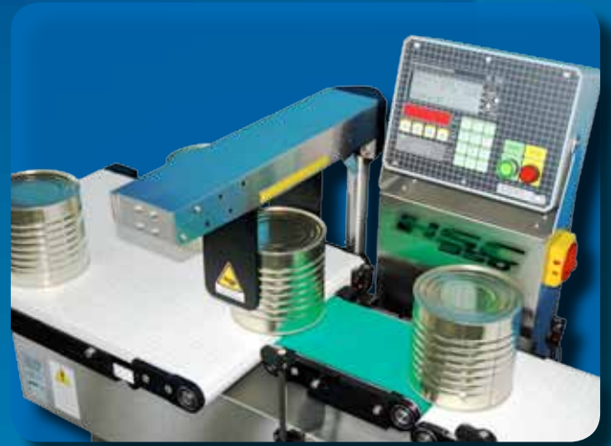
3 channels sorter

The "P" series HSC350 checkweighers fully comply with the most stringent standards governing hygiene, cleanliness and sanitizability in wet environments.