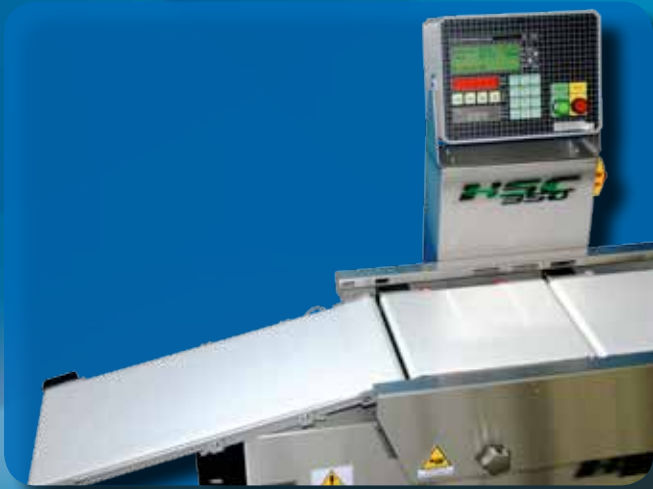
Fall conveyor rejector

The HSC350 "C" series checkweigher is the compact, modular, cost-effective solution that integrates the quality control line when space is at a premium.