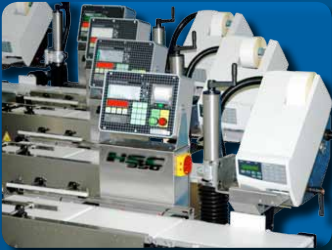
Simple and reliable

A new generation of weighing and labelling systems able to provide an excellent performance at an unrivalled cost ratio.