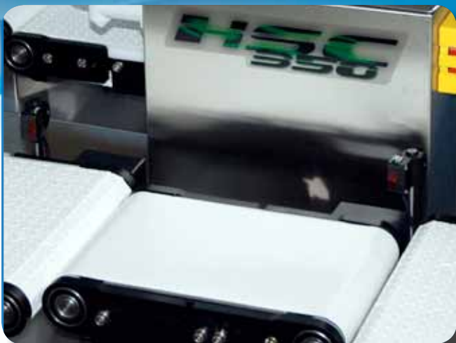
Strong and accurate construction