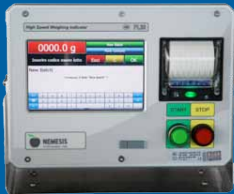
7" HD Touchscreen interface

A wide variety of solutions can be created to suit the most different production requirements thanks to the comprehensive range of control panels, weighing units and setups.