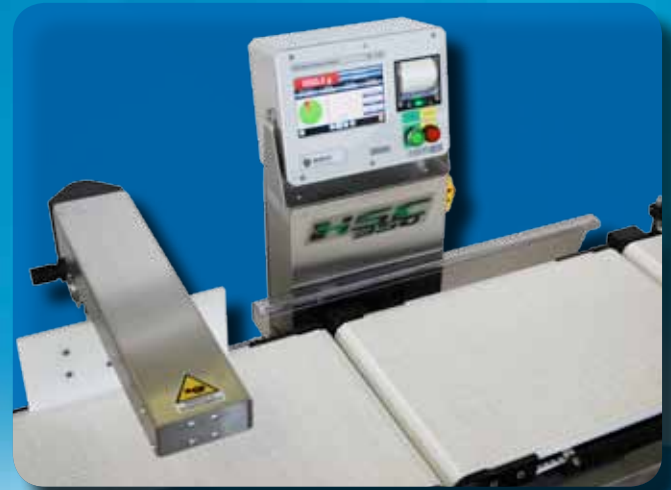
Rejector for bags