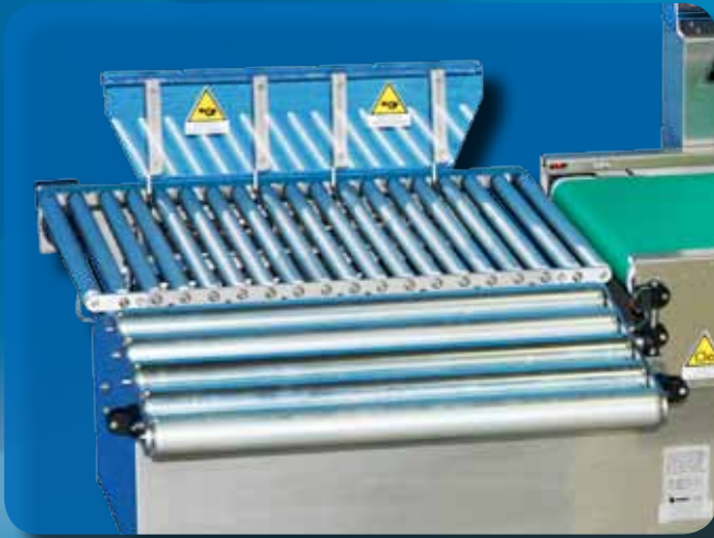
Rejector for boxes