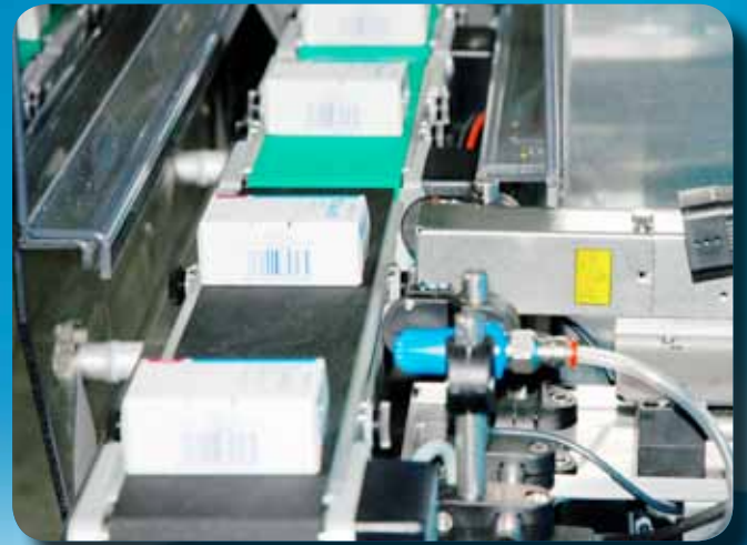
Marking and inspection system